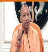
Mahanth Yogi Aditya Nath Ji Maharaj Manager/ Secretary Digvijai Nath Post Graduate College, Gorakhpur, UP